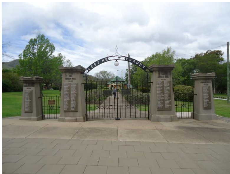
Anzac Park World War One Memorial Gates