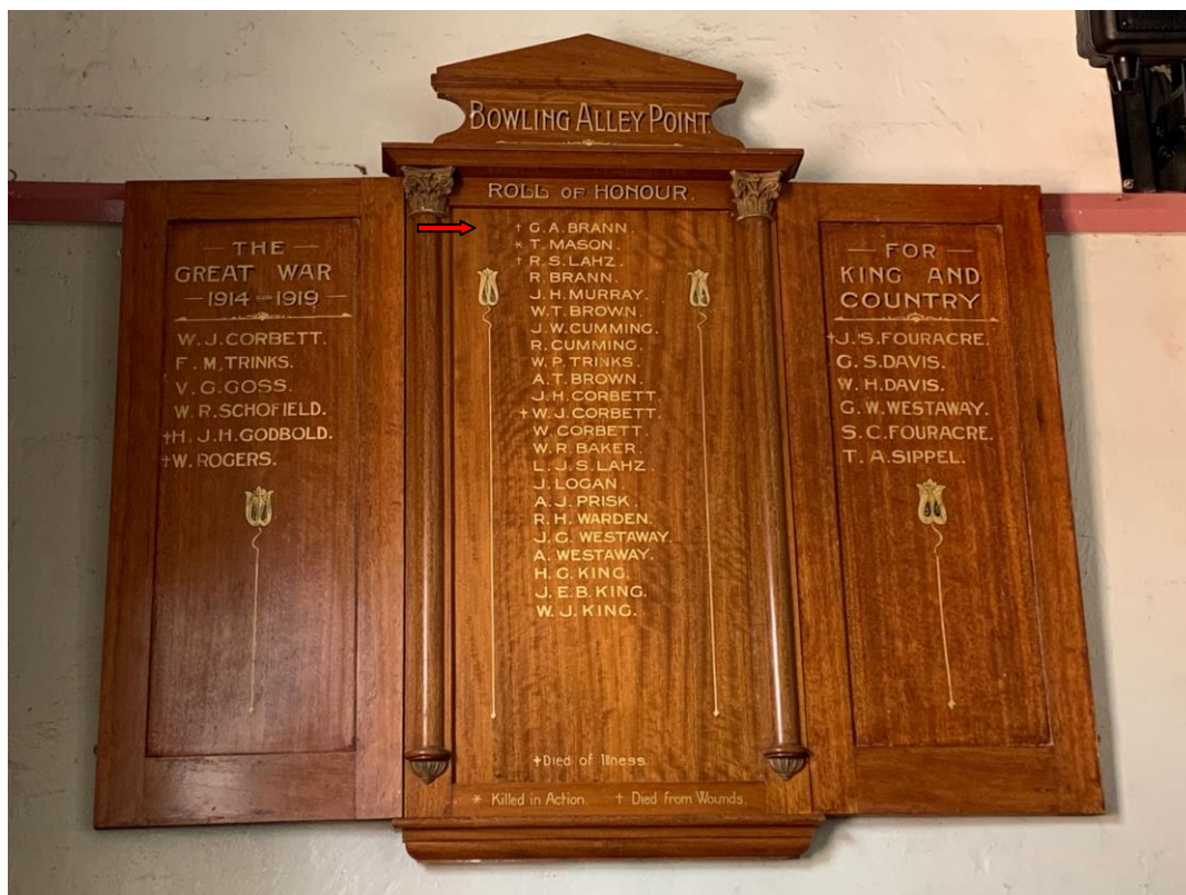
Bowling Alley Point Great War Roll of Honour